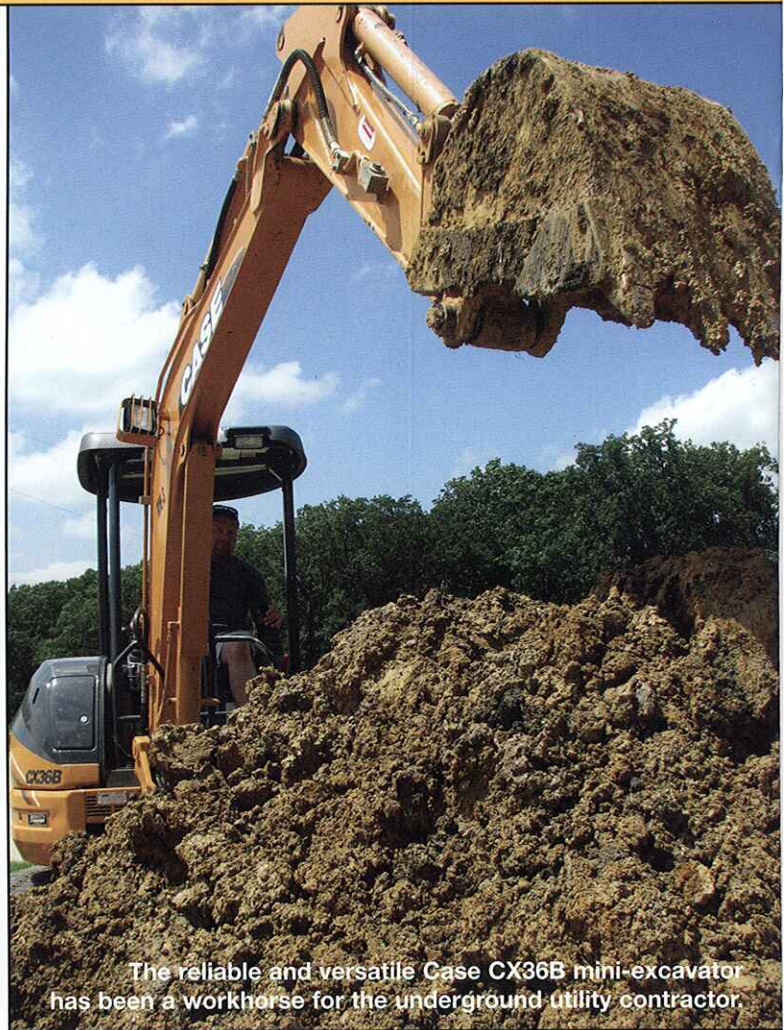
The reliable and versatile Case CX36B mini-excavator has been a workhorse for the underground utility contractor.

"We like the stability of the CX36B. We demoed a bunch of different brands, and we felt the Case was the best. It's operator friendly, and it's a good choice for laying fiber optic because it won't tear up a customer's yard as much as a backhoe," Tharp observed. "The Case is easy to maneuver;